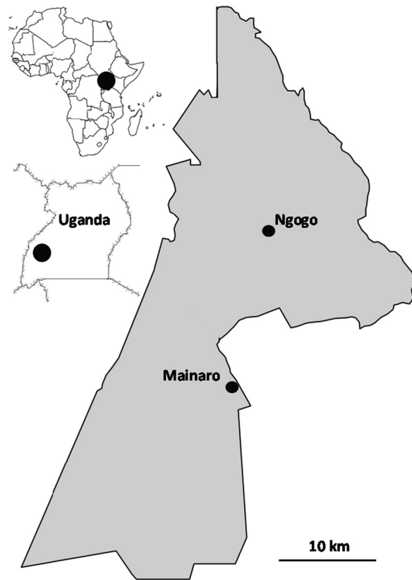
Figure 1: Map of Kibale National Park, Uganda.

Kibale National Park, Uganda (766 km 2 ) is a moist, evergreen medium-altitude forest with a mosaic of old-growth forest, swamp, grassland and regenerating forest of varying ages